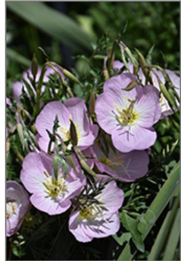
Evening Primrose flowers