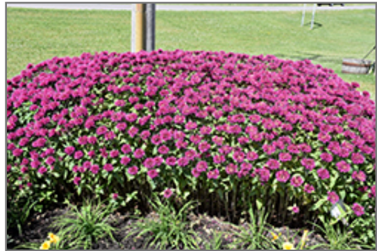
Grand Marshall Bee Balm in bloom