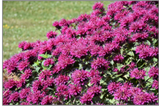
Grand Marshall Bee Balm flowers

Grand Marshall Bee Balm is recommended for the following landscape applications;