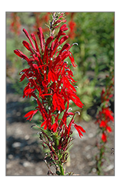
Cardinal Flower flowers