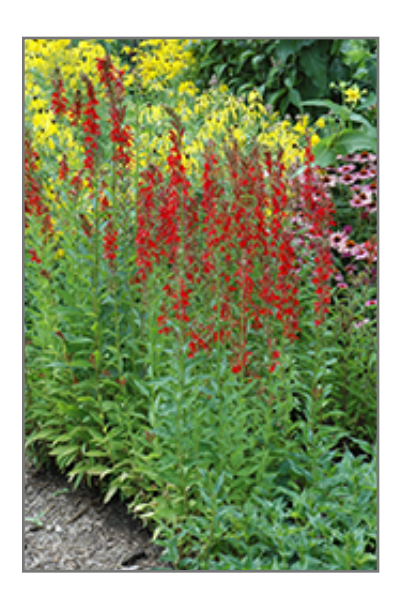
Cardinal Flower in bloom