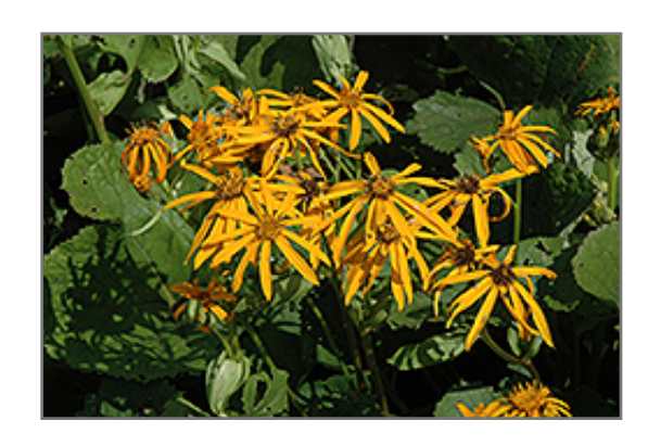
Othello Ligularia flowers