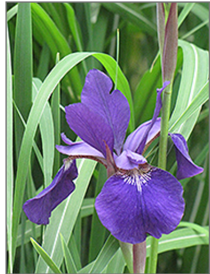
Caesar's Brother Iris flowers