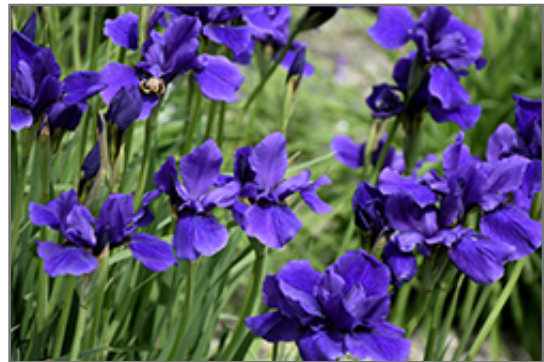
Caesar's Brother Iris flowers