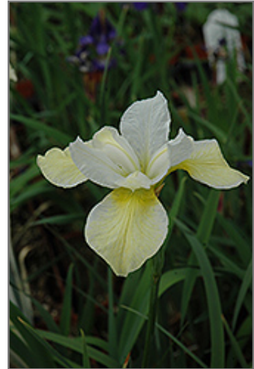
Butter And Sugar Iris flowers

Butter And Sugar Iris will grow to be about 24 inches tall at maturity extending to 3 feet tall with the flowers, with a spread of 30 inches. It grows at a medium rate, and under ideal conditions can be expected to live for approximately 10 years. As an herbaceous perennial, this plant will usually die back to the crown each winter, and will regrow from the base each spring. Be careful not to disturb the crown in late winter when it may not be readily seen!