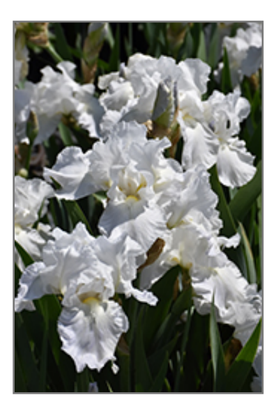
Immortality Iris flowers

Immortality Iris features bold white flag-like flowers with a buttery yellow beard at the ends of the stems in mid spring. The flowers are excellent for cutting. Its sword-like leaves remain green in color throughout the season.