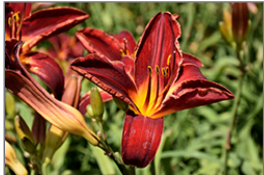
Baja Daylily flowers