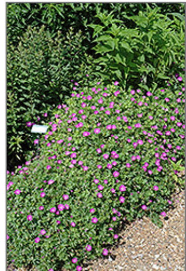
Max Frei Geranium in bloom