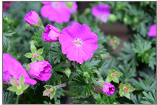
Max Frei Geranium flowers

Max Frei Geranium will grow to be about 9 inches tall at maturity, with a spread of 24 inches. Its foliage tends to remain low and dense right to the ground. It grows at a medium rate, and under ideal conditions can be expected to live for approximately 10 years. As an herbaceous perennial, this plant will usually die back to the crown each winter, and will regrow from the base each spring. Be careful not to disturb the crown in late winter when it may not be readily seen!