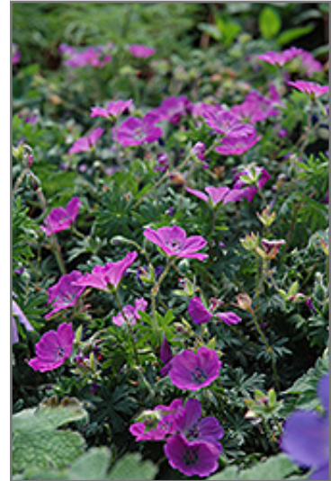
Max Frei Geranium flowers

This is a relatively low maintenance plant, and should only be pruned after flowering to avoid removing any of the current season's flowers. It is a good choice for attracting butterflies to your yard, but is not particularly attractive to deer who tend to leave it alone in favor of tastier treats. It has no significant negative characteristics.