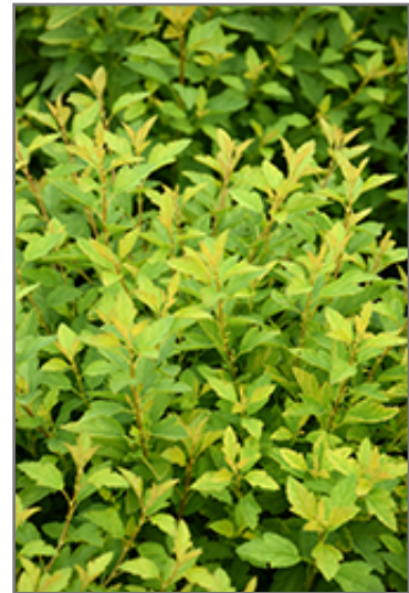
Raspberry Lemonade Ninebark foliage

Raspberry Lemonade Ninebark is recommended for the following landscape applications;