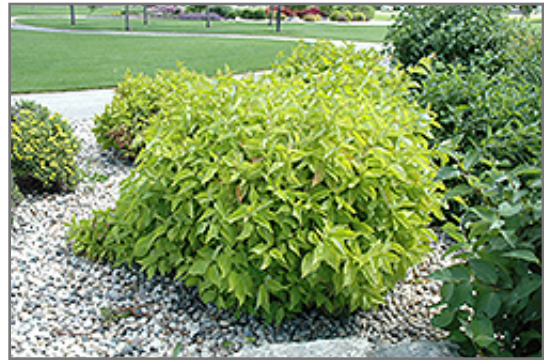
Prairie Fire Dogwood

Prairie Fire Dogwood is recommended for the following landscape applications;