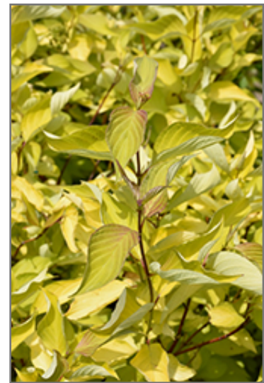
Prairie Fire Dogwood foliage