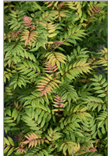
Mr. Mustard False Spirea foliage