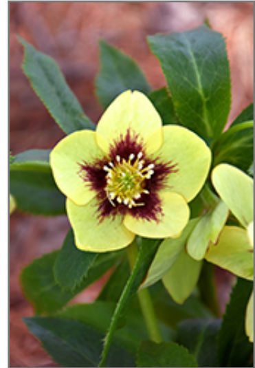
Honeymoon Spanish Flare Lenten Rose flowers

Honeymoon Spanish Flare Lenten Rose is recommended for the following landscape applications;