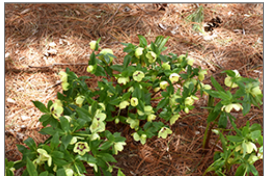
Honeymoon Spanish Flare Lenten Rose in bloom