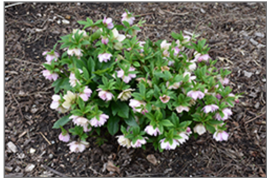
Wedding Party Flower Girl Lenten Rose in bloom