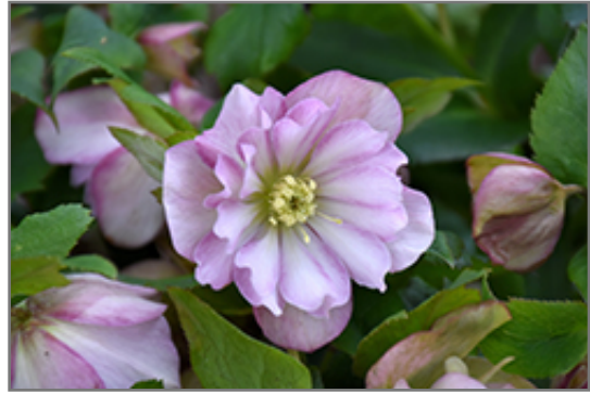
Wedding Party Flower Girl Lenten Rose flowers

Wedding Party Flower Girl Lenten Rose is recommended for the following landscape applications;