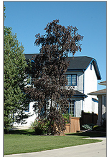
Royal Frost Birch

Royal Frost Birch will grow to be about 30 feet tall at maturity, with a spread of 15 feet. It has a low canopy with a typical clearance of 3 feet from the ground, and should not be planted underneath power lines. It grows at a fast rate, and under ideal conditions can be expected to live for 40 years or more.