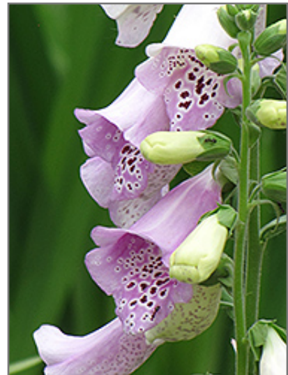
Camelot Lavender Foxglove flowers