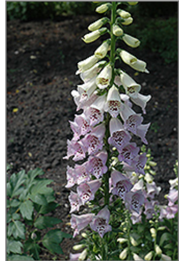
Camelot Lavender Foxglove flowers

Camelot Lavender Foxglove is recommended for the following landscape applications;