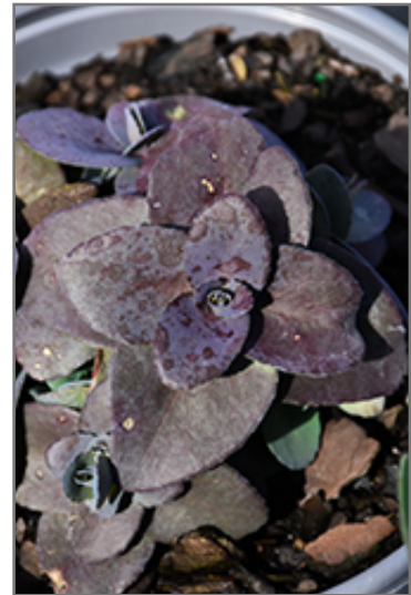
Mojave Jewels Sapphire Sedum foliage

Mojave Jewels Sapphire Sedum is recommended for the following landscape applications;