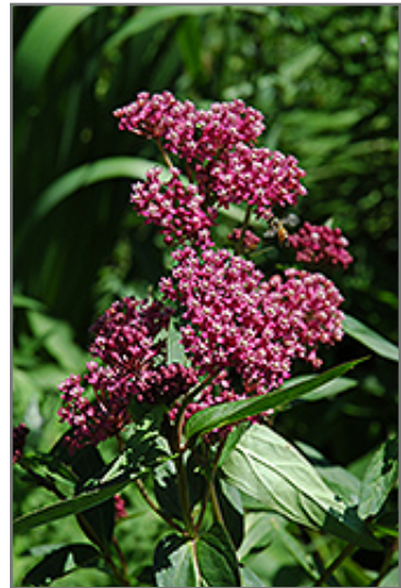
Swamp Milkweed flowers

Swamp Milkweed is recommended for the following landscape applications;