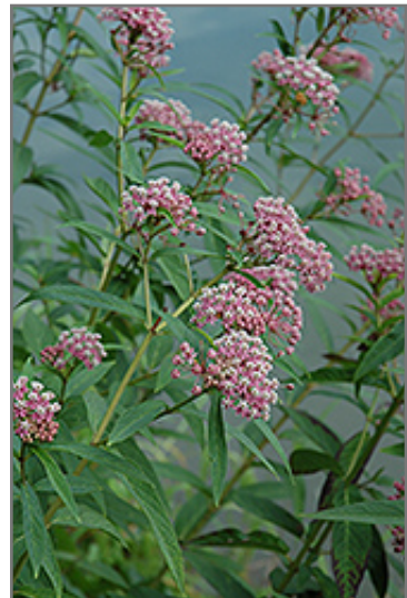
Swamp Milkweed flowers