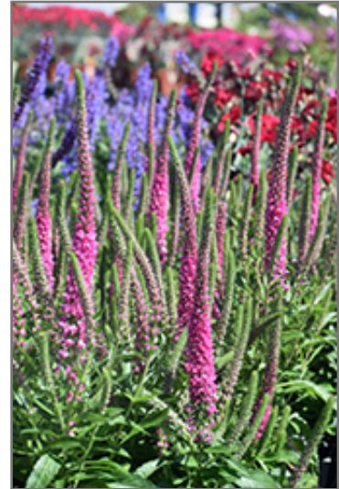
Red Fox Veronica flowers

Red Fox Veronica is recommended for the following landscape applications;