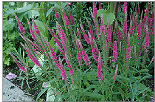
Red Fox Veronica flowers