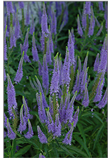
Sunny Border Blue Veronica flowers