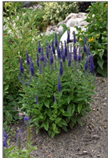
Sunny Border Blue Veronica in bloom