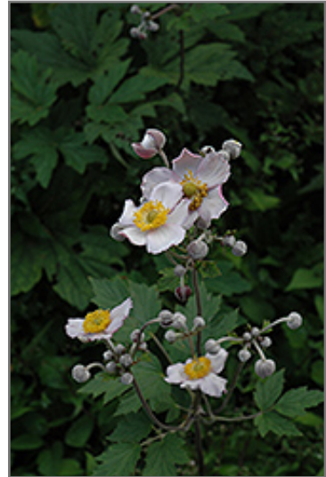
Robustissima Anemone flowers

Robustissima Anemone is recommended for the following landscape applications;