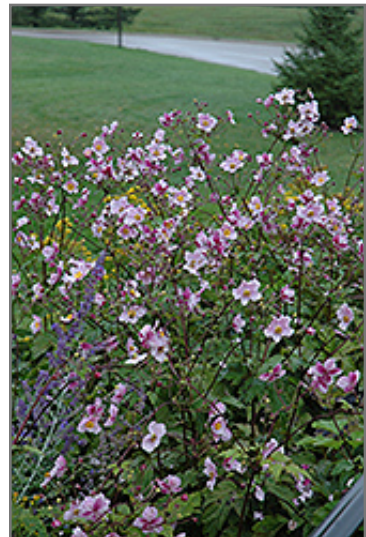
Robustissima Anemone flowers