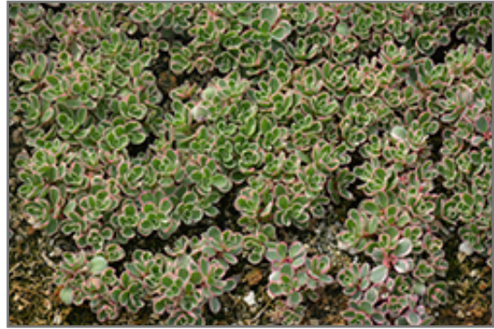
Tricolor Stonecrop (Sedum) flowers

Tricolor Stonecrop (Sedum) will grow to be only 4 inches tall at maturity, with a spread of 18 inches. When grown in masses or used as a bedding plant, individual plants should be spaced approximately 15 inches apart. Its foliage tends to remain low and dense right to the ground. It grows at a fast rate, and under ideal conditions can be expected to live for approximately 10 years. As an herbaceous perennial, this plant will usually die back to the crown each winter, and will regrow from the base each spring. Be careful not to disturb the crown in late winter when it may not be readily seen!