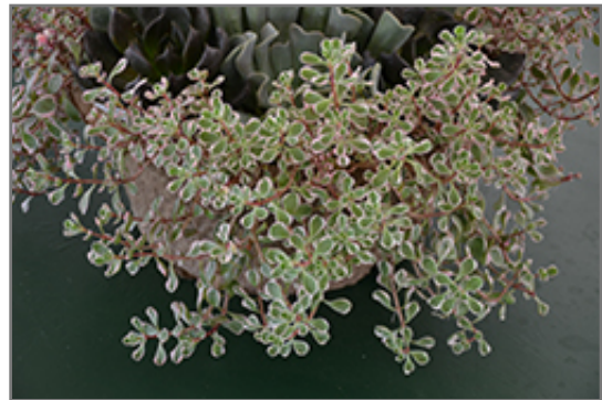
Tricolor Stonecrop (Sedum)