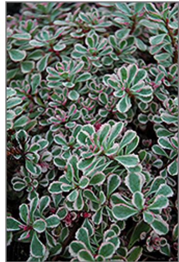
Tricolor Stonecrop (Sedum) foliage

Tricolor Stonecrop (Sedum) is recommended for the following landscape applications;