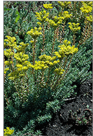
Blue Spruce Sedum flowers

Blue Spruce Sedum is smothered in stunning gold star-shaped flowers at the ends of the stems from early to mid summer. Its attractive succulent needle-like leaves remain silvery blue in color throughout the season.