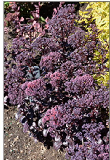
Dark Magic Sedum in bloom