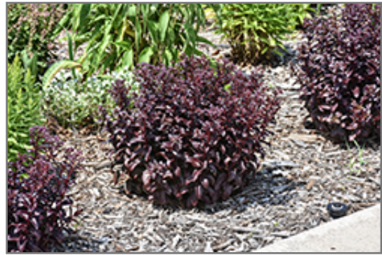
Dark Magic Sedum in bloom

Dark Magic Sedum will grow to be about 12 inches tall at maturity, with a spread of 20 inches. When grown in masses or used as a bedding plant, individual plants should be spaced approximately 16 inches apart. It grows at a fast rate, and under ideal conditions can be expected to live for approximately 15 years. As an herbaceous perennial, this plant will usually die back to the crown each winter, and will regrow from the base each spring. Be careful not to disturb the crown in late winter when it may not be readily seen!