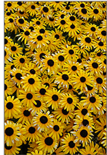
Viette's Little Suzy Black-Eyed Susan flowers