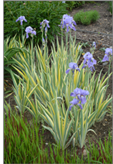
White Variegated Iris in bloom