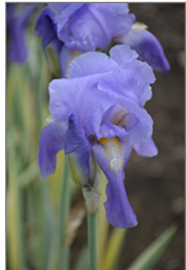
White Variegated Iris flowers