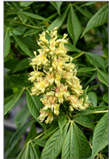
Ohio Buckeye flowers