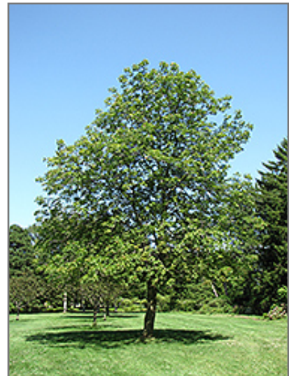
Ohio Buckeye