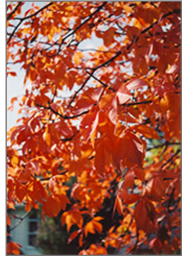
Ohio Buckeye in fall

This tree does best in full sun to partial shade. It prefers to grow in average to moist conditions, and shouldn't be allowed to dry out. It is not particular as to soil type or pH. It is highly tolerant of urban pollution and will even thrive in inner city environments. This species is native to parts of North America.