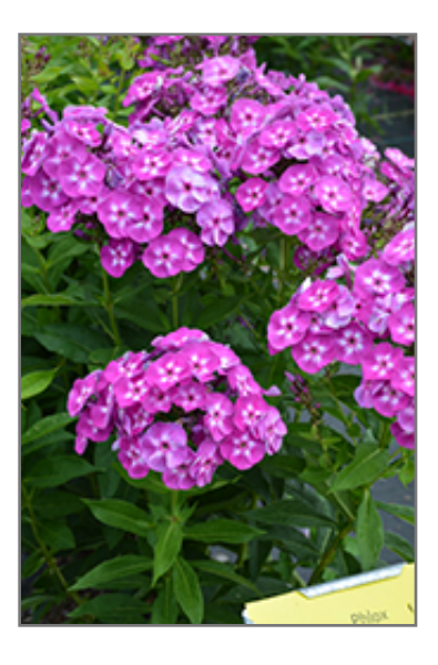
Laura Garden Phlox flowers

Laura Garden Phlox features bold fragrant conical lilac purple star-shaped flowers with white eyes at the ends of the stems from early summer to early fall. The flowers are excellent for cutting. Its narrow leaves remain green in color throughout the season.