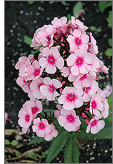
Bright Eyes Garden Phlox flowers

Bright Eyes Garden Phlox is a fine choice for the garden, but it is also a good selection for planting in outdoor pots and containers. With its upright habit of growth, it is best suited for use as a 'thriller' in the 'spiller-thriller-filler' container combination; plant it near the center of the pot, surrounded by smaller plants and those that spill over the edges. It is even sizeable enough that it can be grown alone in a suitable container. Note that when growing plants in outdoor containers and baskets, they may require more frequent waterings than they would in the yard or garden.