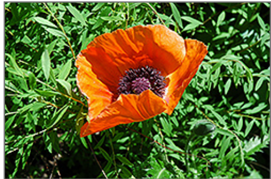
Oriental Poppy flowers

Oriental Poppy will grow to be about 3 feet tall at maturity, with a spread of 24 inches. It grows at a fast rate, and under ideal conditions can be expected to live for approximately 5 years. As an herbaceous perennial, this plant will usually die back to the crown each winter, and will regrow from the base each spring. Be careful not to disturb the crown in late winter when it may not be readily seen! As this plant tends to go dormant in summer, it is best interplanted with late-season bloomers to hide the dying foliage.