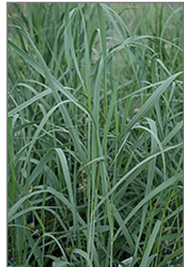
Heavy Metal Blue Switch Grass foliage