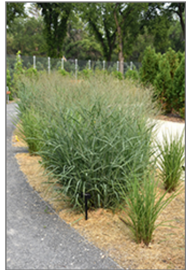
Heavy Metal Blue Switch Grass