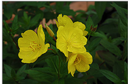
Sundrops Primrose flowers