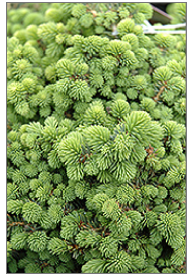
Little Gem Spruce foliage