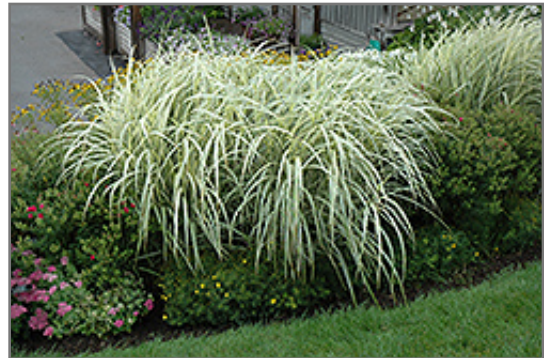
Variegated Maiden Grass