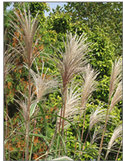
Variegated Maiden Grass flowers