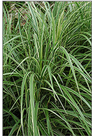
Variegated Maiden Grass

This plant does best in full sun to partial shade. It prefers to grow in average to moist conditions, and shouldn't be allowed to dry out. It is not particular as to soil type or pH. It is highly tolerant of urban pollution and will even thrive in inner city environments. This is a selected variety of a species not originally from North America. It can be propagated by division; however, as a cultivated variety, be aware that it may be subject to certain restrictions or prohibitions on propagation.