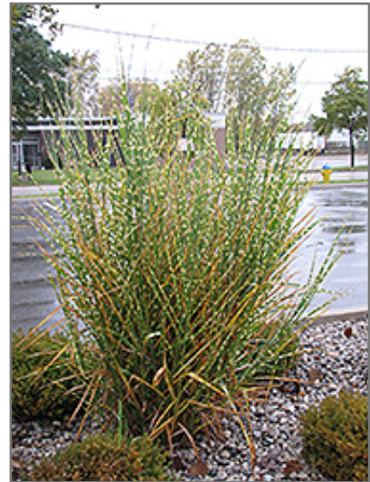
Porcupine Maiden Grass