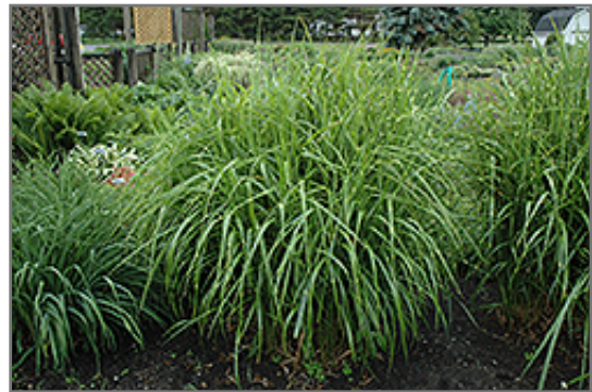
Porcupine Maiden Grass