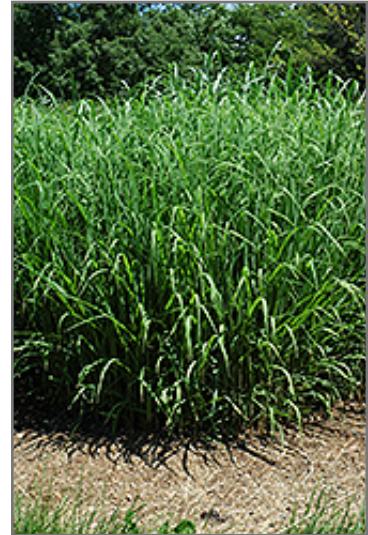
Silver Feather Maiden Grass