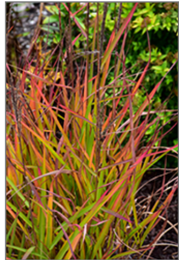
Purple Flame Grass in fall

This plant does best in full sun to partial shade. It prefers to grow in average to moist conditions, and shouldn't be allowed to dry out. It is not particular as to soil type or pH. It is highly tolerant of urban pollution and will even thrive in inner city environments. This is a selected variety of a species not originally from North America. It can be propagated by division; however, as a cultivated variety, be aware that it may be subject to certain restrictions or prohibitions on propagation.