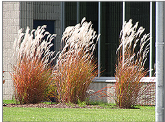
Purple Flame Grass in bloom