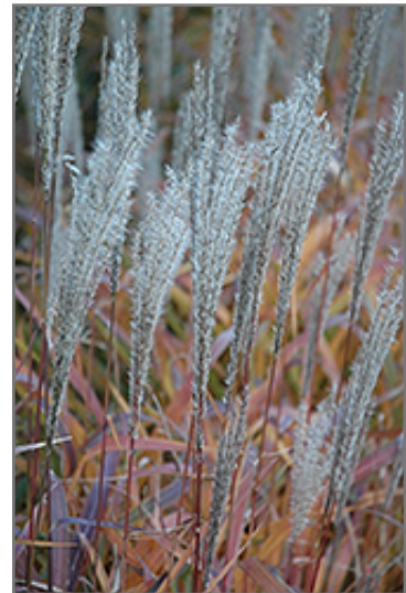
Purple Flame Grass fruit