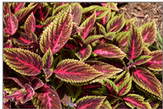
Ruby Road Coleus foliage