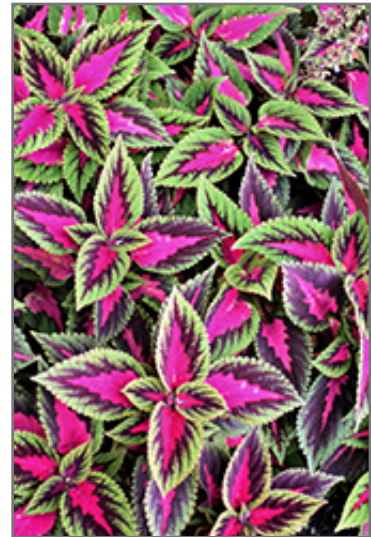
Ruby Road Coleus foliage

Ruby Road Coleus is recommended for the following landscape applications;