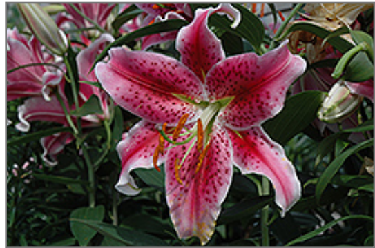
Stargazer Lily flowers

Stargazer Lily features bold fragrant crimson trumpet-shaped flowers with pink overtones, white throats and white edges at the ends of the stems in late summer. The flowers are excellent for cutting. Its narrow leaves remain green in color throughout the season.