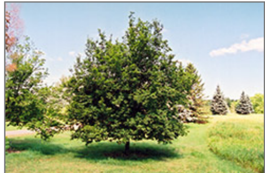
American Hop Hornbeam