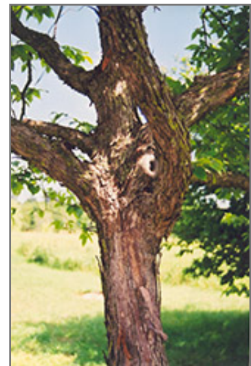
American Hop Hornbeam bark