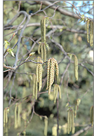
American Hop Hornbeam flowers

This tree does best in full sun to partial shade. It is very adaptable to both dry and moist locations, and should do just fine under average home landscape conditions. It is not particular as to soil type or pH. It is quite intolerant of urban pollution, therefore inner city or urban streetside plantings are best avoided, and will benefit from being planted in a relatively sheltered location. Consider applying a thick mulch around the root zone in winter to protect it in exposed locations or colder microclimates. This species is native to parts of North America.