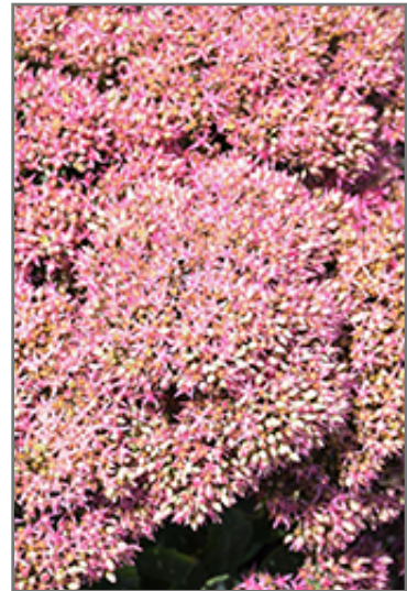
Powderpuff Sedum flowers

Powderpuff Sedum is recommended for the following landscape applications;