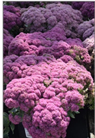
Powderpuff Sedum flowers