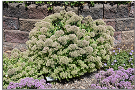
Powderpuff Sedum in bloom

Powderpuff Sedum will grow to be about 8 inches tall at maturity, with a spread of 18 inches. When grown in masses or used as a bedding plant, individual plants should be spaced approximately 16 inches apart. Its foliage tends to remain low and dense right to the ground. It grows at a fast rate, and under ideal conditions can be expected to live for approximately 15 years. As an herbaceous perennial, this plant will usually die back to the crown each winter, and will regrow from the base each spring. Be careful not to disturb the crown in late winter when it may not be readily seen!