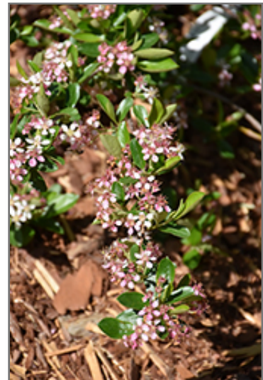
Ground Hug Chokeberry flowers