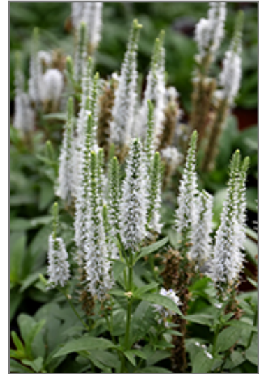
Snow Candles Veronica flowers