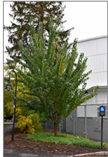
White Shield Osage Orange