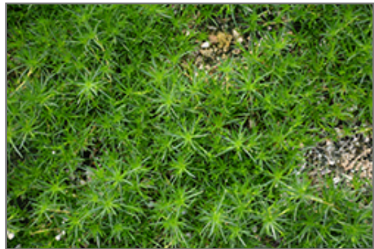
Irish Moss foliage