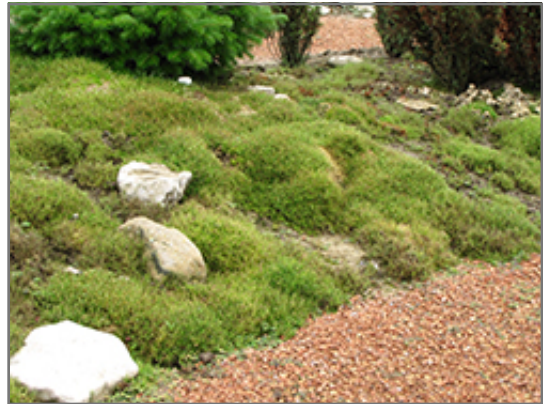
Irish Moss

This plant does best in full sun to partial shade. It does best in average to evenly moist conditions, but will not tolerate standing water. It is not particular as to soil type or pH. It is highly tolerant of urban pollution and will even thrive in inner city environments. Consider covering it with a thick layer of mulch in winter to protect it in exposed locations or colder microclimates. This species is not originally from North America. It can be propagated by division.