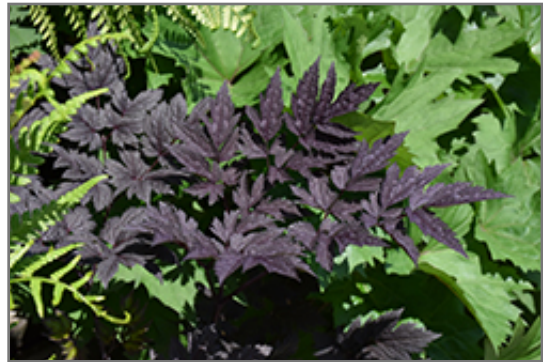
Pink Spike Snakeroot foliage