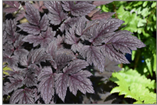
Pink Spike Snakeroot foliage

Pink Spike Snakeroot is recommended for the following landscape applications;