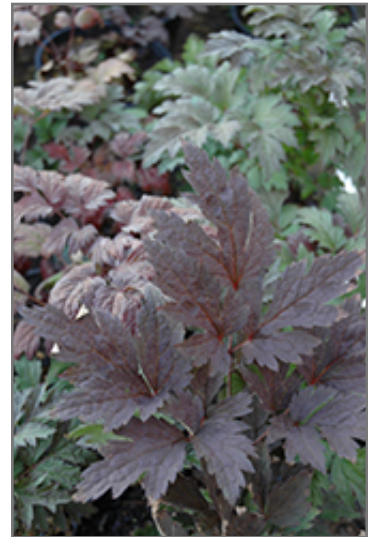
Brunette Snakeroot foliage