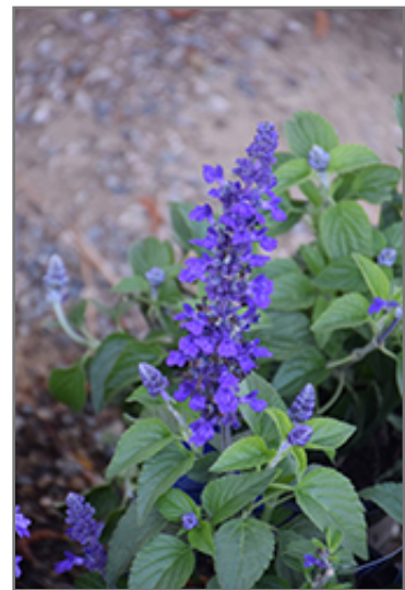
Mysty Salvia flowers