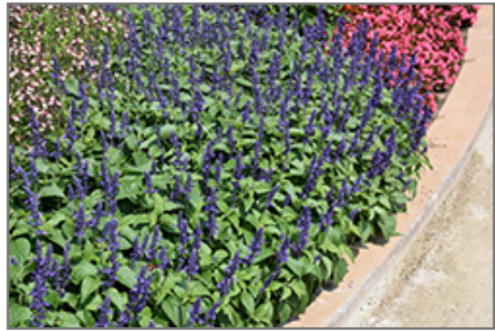
Mysty Salvia in bloom

Mysty Salvia is recommended for the following landscape applications;