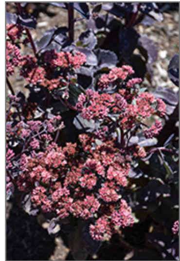
Thunderhead Sedum flowers