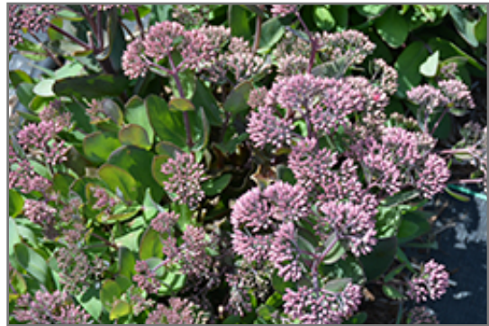
Thunderhead Sedum flower buds

Thunderhead Sedum is recommended for the following landscape applications;