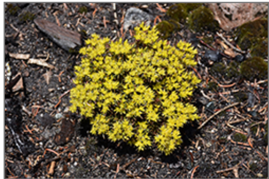
Chocolate Ball Sedum in bloom