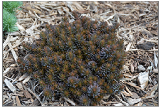
Chocolate Ball Sedum