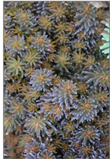
Chocolate Ball Sedum foliage

Chocolate Ball Sedum is a dense herbaceous perennial with a mounded form. Its relatively coarse texture can be used to stand it apart from other garden plants with finer foliage.